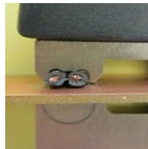
Close-Up of PCB in Hand Termination